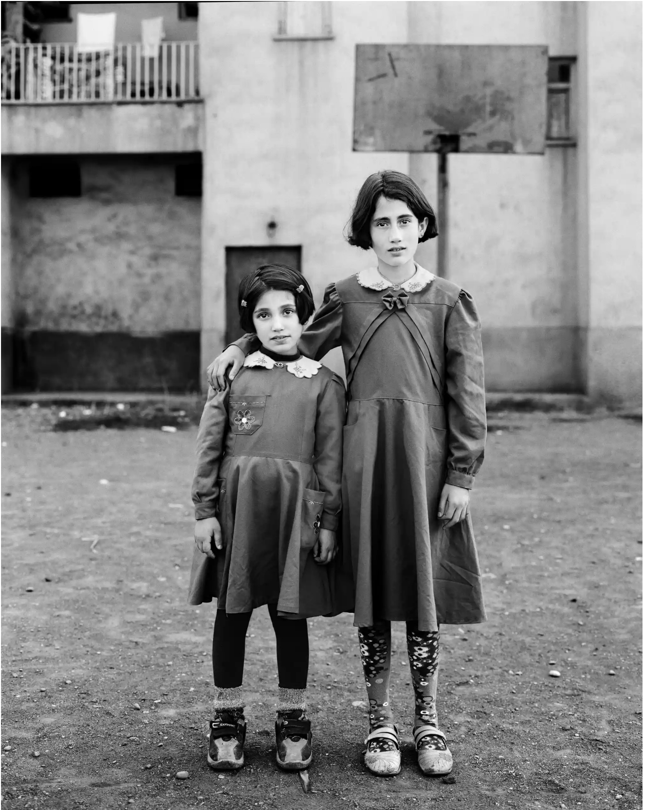
Simply schoolgirls . . . Vanessa Winship's collection features pupils in Eastern Anatolia, Turkey, where the land is harsh and unforgiving. These girls on the borderlands, until recently, had never stepped into a school playground VANESSA WINSHIP