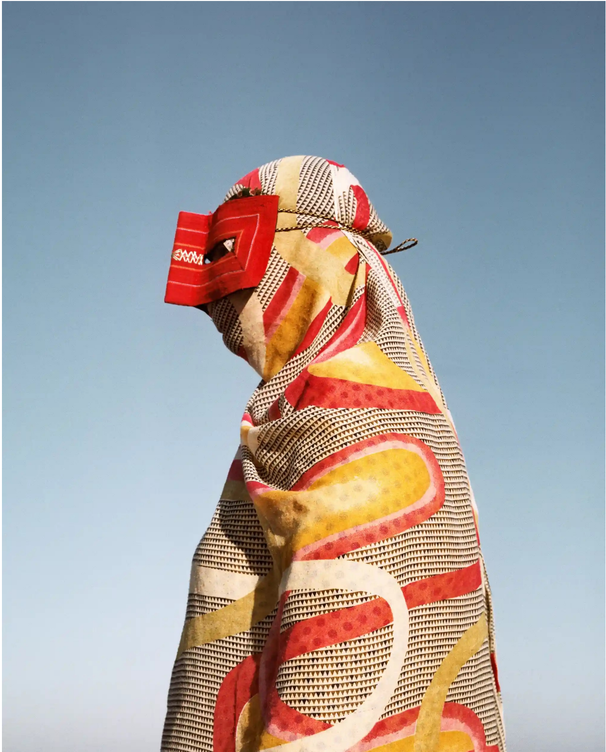
Winds of change . . . Hoda Afshar's collection looks at the belief in the existence of harmful winds that can possess a person. This distinctive belief has emerged in the islands off the southern coast of Iran HODA AFSHAR