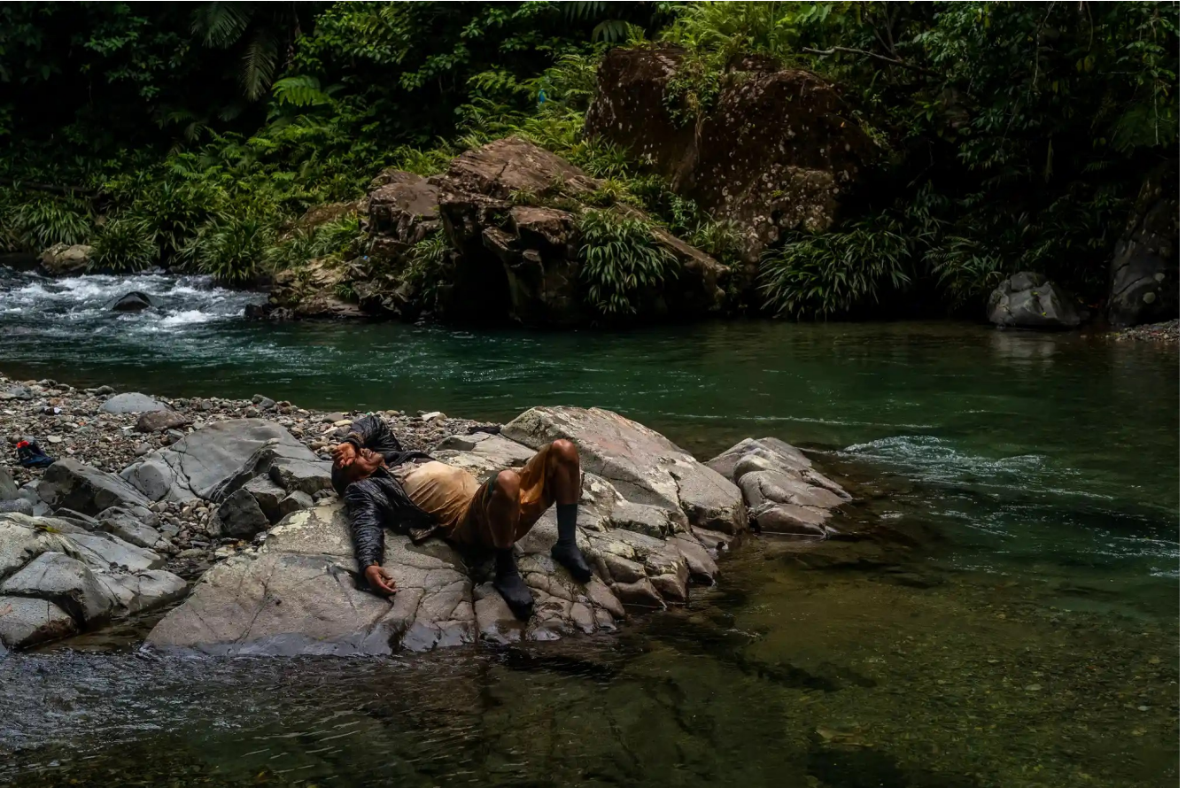
Melting planet . . . Ragnar Axelsson's photo of the Kýtluþýkull glacier, in Iceland, looks at the melting and retreating landscape — and how the people living in the Arctic cope with changing temperatures