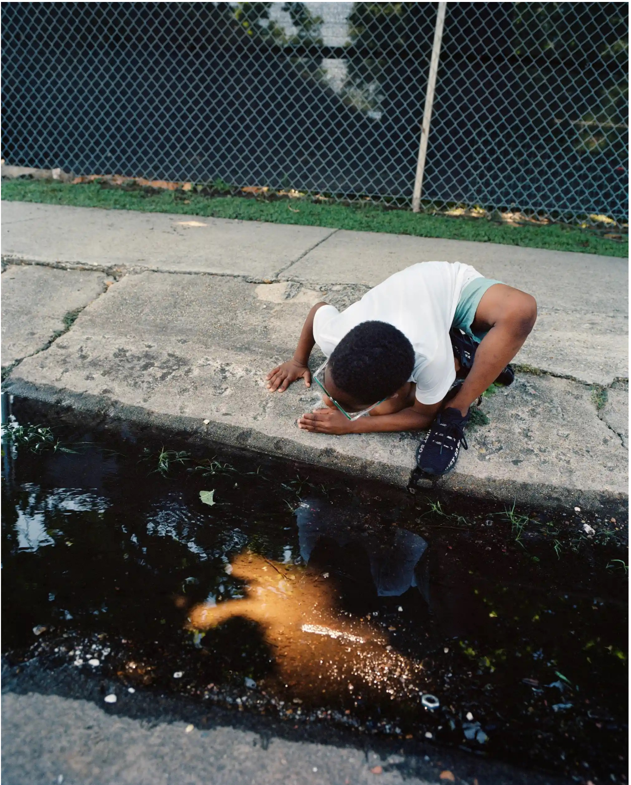
Mystery street . . . Vasantha Yoganathan's photo offers a glimpse of childhood in New Orleans, Louisiana, as children cope with the searing heat and play outdoors